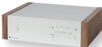
silver with walnut wood side panels