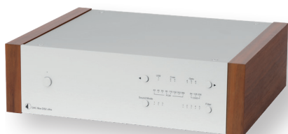
silver with rosewood side panels

The Asahi Kasei AK4490 is a new generation 32bit / 768kHz stereo Premium DAC which adopts the newly developed VELVET SOUND™ technology achieving high resolution sound playback that realizes a rich sound field and bass representation with less distortion. 5 digital filters and 3 sound modes can be selected. The AK4490 DAC integrates a capacitor filter that greatly reduces sound degradation from noise shaping, achieving a flat noise floor up to 200kHz.