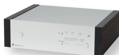
silver with eucalyptus wood side panels