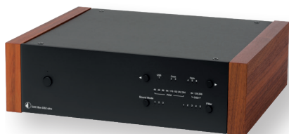
black with rosewood side panels