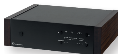
black with eucalyptus wood side panels